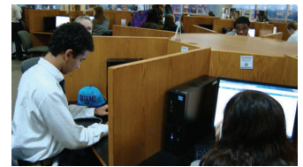
All the cool kids are in the library before school.