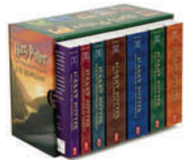
The Harry Potter series: #1 on the NPR's Best-Ever Teen Novels list