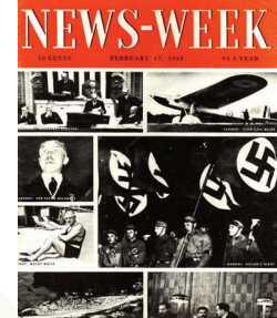
Pictured here is Newsweek's 1st issue on 2/17/33. Newsweek goes digital in 2013.

Although TEL does not have a definitive contract, our hopes are for a smooth transition from print to digital. I will keep you posted on this transition.